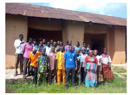
Inauguration of Human Rights Club in Okhuesan community, Esan South East LGA

Advocates as well as members of the Human Rights Clubs.