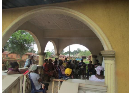
Some participants during sensitization in Idumebo

fighting against human trafficking, responding to the