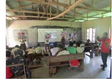
Some students with placards while the staff explains to the students

documentary was shown to the students about the dangers