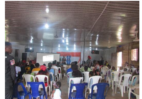
A staff speaking to the congregation in Potters watch church

The team of Uromi Justice Development peace and caritas Initiatives visited potter's Watch Church Irrua to sensitize members on the dangers and ills of human trafficking and irregular migration. The team explained to the congregation the dangers of human trafficking and encouraged parents to train their children as even the word of God said train up your child in the way he should go and he will not depart from such godly upbringing.