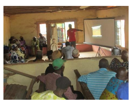
The participants watching the documentary with kin interest

This community was visited on the 12<sup>th</sup> of June, 2019 with the aim to conduct sensitization. During which a brief documentary was shown to the participants for the people to see the dangers of travelling through the Mediterranean Sea and they all watched with