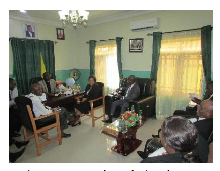
Project team members during the meeting

North East, Esan Central, Esan South East and Igueben