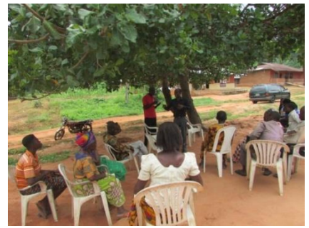
Sensitization at Ikhekhe Community

Following the presentation, one of the participants in Ikekhen community in Ewatto pointed to the fact that the parents present should train their children well to make a good community, he added that parents who refuse to bring up their children well we always regret at their old age.