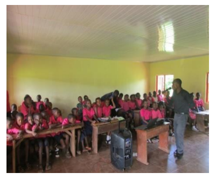
Sensitization at Agada Primary School

irregular migration. The schools visited were Usenu and Uwenujie Primary schools in Esan Central LGA as well as Eguare primary school, Ewatto and Agadaga primary school, Ewohimi both in Esan South East LGA. The event began with the introduction of the team members to the students and teachers who were present for the sensitization. The project team explained to the