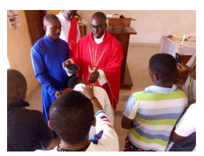
An inmate being baptized at the

baptism which is a sacrament that cleans one from original sin