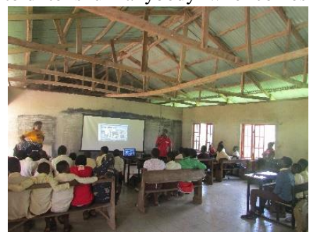
A staff speaking to the students on human trafficking

told to shun anybody who comes to them with false hope and