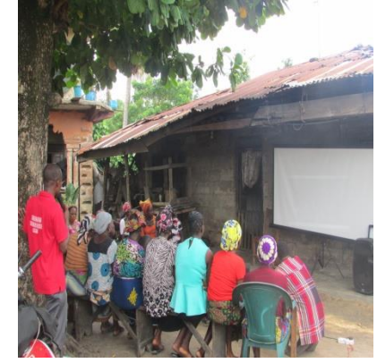
Participants listening and watching the film during sensitization

The elders and the youths present were enjoined not to be deceived by relatives or family friends who come to them promising them of jobs that they can provide for them abroad. These are some of the tricks the traffickers play