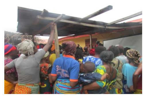
Some participants viewingdocumentary at Omioboyo market

Participants which were made up of both men and women as well as youth in the market were told about the evils of human trafficking and the need for safe migration. Parents and youth present were therefore counseled to watch out for traffickers who deceive people with unrealistic promising future and to stop giving their children out as house boys/girls because of the many