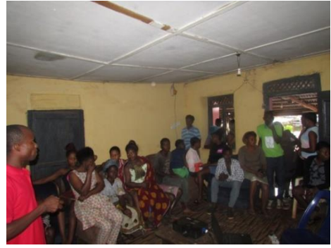
Sensitization at Uwenujie community

Some community members after watching the documentaries, commended the project team for the sensitization and appealed for the creation of alternatives through empowerment or vocational training for the youth. They added that some of those who fall victims to human traffickers did not envisage that they would end up that way. They embarked on the journey to Europe out of despiration with a view to making a out of their life since