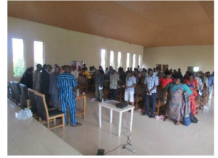
Opening prayer to declare the inaugural meeting open

the project team to allow for the provision of technical support and mentorship to the various clubs. Copies of the