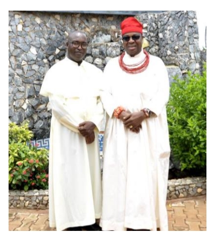
The executive Director with a Monarch during advocacy visit

seeking their cooperation, collaboration and participation to carry out the intervention on Human Right Education and Paralegal Scheme in their various domains and areas of interest.. The goal is to see that a contribution is made