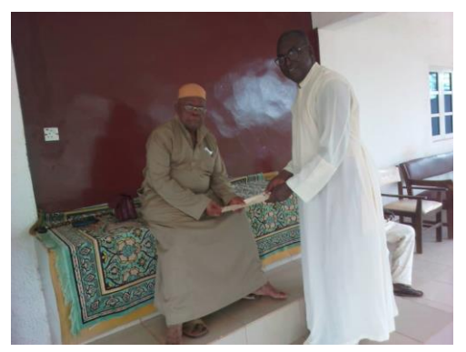
Presentation of advocacy letter to the Monarch

include training of 55 Paralegals to document and intervene in cases of human rights violations as well as provide advice to victims. This is to ensure that community members have improved knowledge and consciousness of human rights and are willing to report human rights violations. This project will also promote the active participation of women in the civil, cultural, economic,