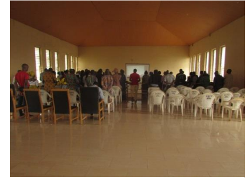
Opening session of the training

The training also featured a brainstorming session in which participants were shared into five groups with the following question to brainstorm on: