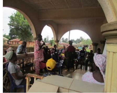
Some participants during sensitization in Idumebo

government to fight against human trafficking. The government has made effort to protect citizens who are