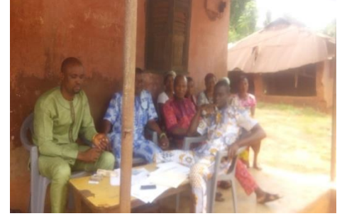
A group of beneficiaries in Ukhun community

the farmers. The scheme is designed to address the plight of the rural farmers to help increase their agricultural