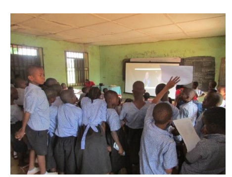
Sensitization at Usenu Primary School

students the purpose of the sensitization which was to create awareness on the dangers of human trafficking. The team spoke on the dangers of human trafficking and how victims were ill-treated and