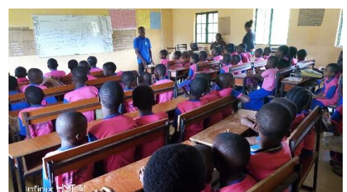
Sensitization in Eko lyobhebhe Primary School

society. A total of 39 pupils were reached comprising of 18males and 21