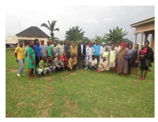
Group photograph of participants in Irrua community meeting

Uromi JDPCI as part of the efforts to sustain the achievement of the SMAT-P project organized two community meetings, one in