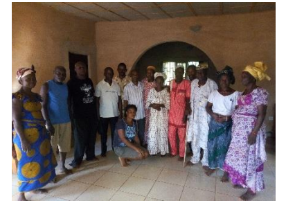
Inauguration at Egbele, Esan North East LGA

raising and sensitization in their various communities so as to be able to enlighten their communities on human rights promotion and protection.