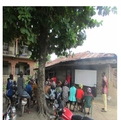
Participants listening and watching the film during sensitization

Participants in the community were informed that irregular migrants go through terrible ordeals on their journey to Europe. Most of them are eventually trafficked on the course of the journey, some migrants have to drink the urine of their co travelers in the Sahara desert when they run out