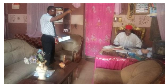
Explanation of the intervention to the Monarch

The Ministry of Justice, Nigerian Bar Association and FIDA also expressed their readiness to partner with Uromi JDPCI