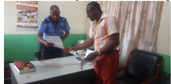
Presentation of advocacy letter to the Area Commander, Irrua Command of the Nigerian Police

commissioners of police, 3 ACPs in charge of the three area