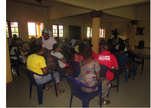
Sensitization at Idumu-Urohi community, Ewohimi

empowerment. The pain involved travelling via desert or Mediterranean Sea as we saw in the video is more than the ones we may think we