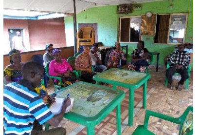
Inauguration of Human Rights Club in Ivue community, Esan North East LGA

As part of efforts in promoting social justice and improving the Human Rights knowledge of citizens, Uromi Justice Development Peace and Caritas Initiatives (Uromi JDPCI) in partnership with Miseror, Germany embarked on Human Right and Paralegal project to sensitize citizens from selected communities on their Rights. This it intends to do with engaging volunteers in Human