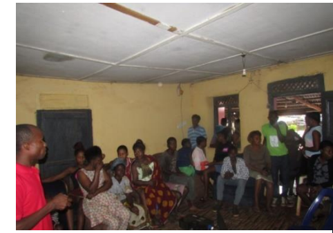
Sensitization at Uwenujie community

vocational training for the youth. They added that some of those who fall victims to human traffickers did not envisage that they would end up that way. They embarked on the journey to Europe out of despiration with a view to making a out of their life since the situation in their country has prevented them from achieving their dreams and aspiration. They were encouraged to embibe the right attitude and orientation on their children as no amount of despiration can take the right attitude away from a well cultured child and that