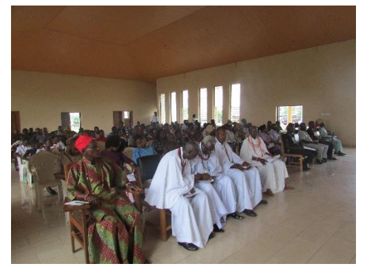
Some Community Chiefs at the event

efforts required to eradicate child labour and also engage government, employers, workers, organizations and civic society as well as people across the globe to highlight the impact of Child Labour on children and how to eliminate it. He further noted that in Edo state the Child Rights Law was passed in 2007 as part of the State Government's effort to promote the protection of children and then urged the stakeholders to sensitize their people on the existence of the law as a tool for child protection. He encouraged parents to desist from engaging their children in domestic or farm work during school hours as all children ought to be in school at such times.