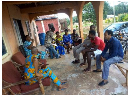
Inauguration at Ewu Esan Central LGA

highlighted. These they were told will enable them to be agents of change and promoters of justice and peace in their various communities. They were also tasked to be prepared for awareness