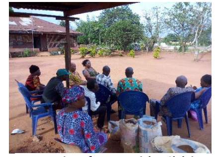
Inauguration of Human Rights Club in Usenu community, Esan Central LGA

Uromi JDPCI initially planned for human right clubs in 25 communities but ended up with 27 human rights clubs in 27 communities because of