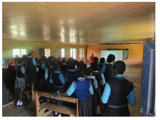
Students watching documentary

Uromi Justice Development Peace and Caritas Initiatives in a bid to reduce menace of human trafficking and irregular Migration went to Ideal Secondary School in Esan Central Local Government Area to sensitize the students on the ills of Human