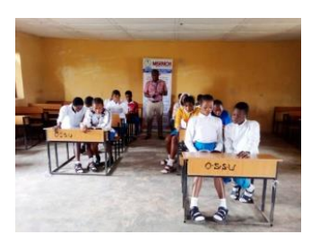
Adolescent Human Right club members in Obedu Secondary School

Uromi JDPCI Project Management Team carried out another impactful learning