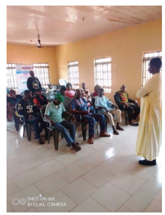
Cross session of participants during the dialogue

of the opinion that childhood ended at the age of 12 while others claimed that childhood ended at the age of 17 years. However, they seem to have a general application to the protection of persons who are under 18 years. For instance, they vehemently kicked against any act of child marriage contracted for any indigenous child whether an act leading to child pregnancy was done or not. Also in the course of discussing issues bothering on child protection, they revealed that a crime of rape was regarded as a very serious offence in the community and where an offender was apprehended, the Community Disciplinary committee handovers such offender to the Law enforcement agents (Police) for adequate procedures for sanction.