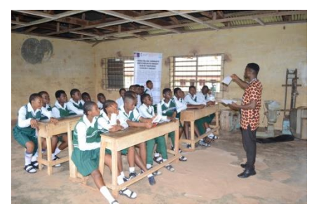
Emaudo Secondary School club meeting

and Obiaza mixed secondary school and St. Johnbosco