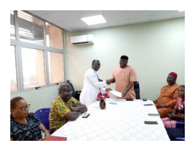
The Executive Director of Uromi JDPCI while presenting the Advocacy letter to the Hon. Commissioner

UROMI JDPCI, other cluster members and CSOs present for this great initiative stating that the issue of human trafficking was a familiar terrain which requires all hands to be on deck to mitigate. She commended that the interventions of Uromi JDPCI and other bodies working in the terrain are recognized and applauded by various stakeholders including the Ministry hence they would not hesitate to provide the necessary support in pushing for the activation of the Local Taskforce once it is approved. She hinted that the bill to translate the Edo State taskforce against Human Trafficking into an Agency started with the erstwhile State Executive before it was dissolved. However with the permission of the Hon. Commissioner, she expressed commitment to find out the current status of the bill and push to see that the Agency is cascaded